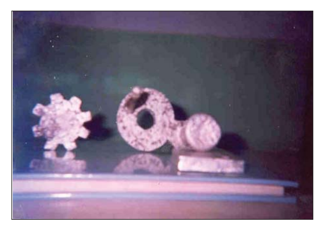
Fig. 3 : Samples made by magnetic moulding.

Samples made by magnetic moulding are shown in Fig. 3.