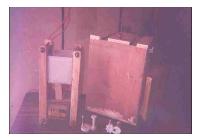
Fig. 2: New design of Magnetic mould box.

TRANSACTIONS OF 61st INDIAN FOUNDRY CONGRESS 2013 -